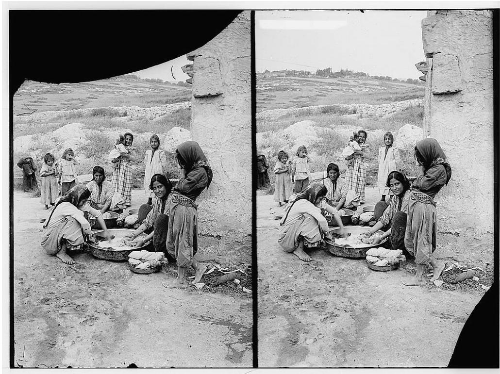
Image: Costumes, characters, etc. Nazareth women washing clothes. Nazareth, 1900. [Approximately to 1920] Photograph. https://www.loc.gov/item/2019692758/ .