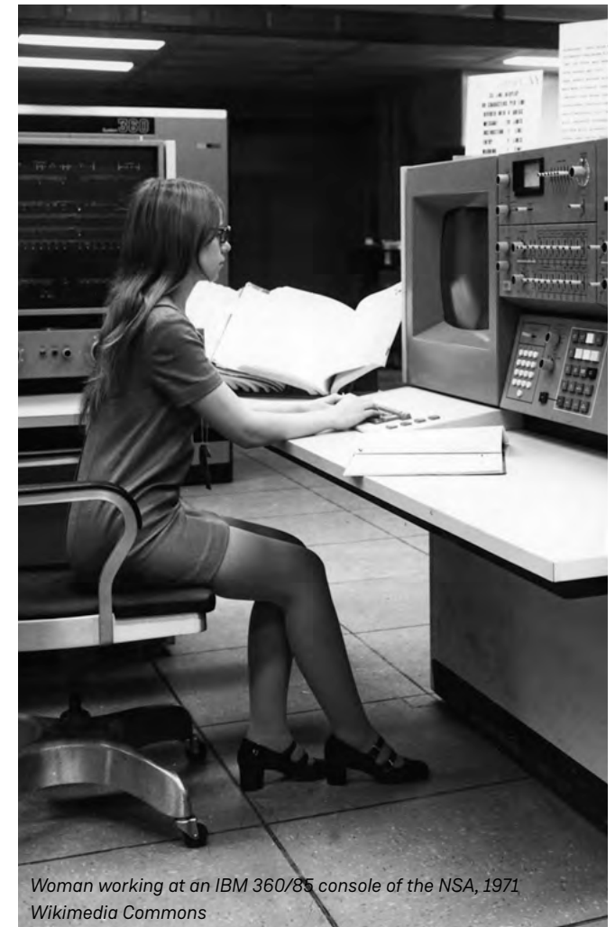
Woman working at an IBM 360/85 console of the NSA, 1971

Scientification, Data Processing and Information Transfer in Secret Services, 1945–1990