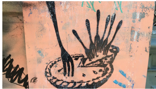
„Ist die Welt ungerecht?“