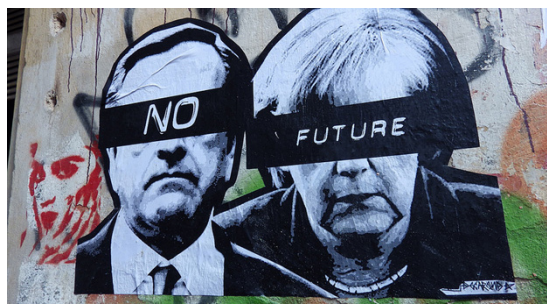
„Die Ästhetik der Kriege“