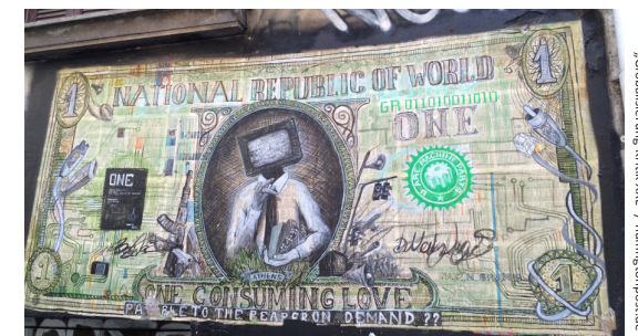
„Globalisierungskritik XXL“ / huffingtonpost.de