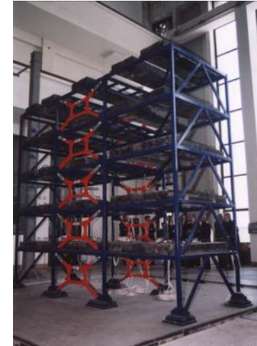
The Shaking Table at IZIIS