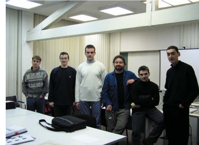
Computer lab with Master students