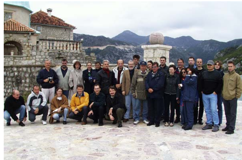
Workshop for Young Engineers, Herceg Novi, 2002