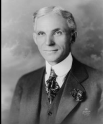
Henry Ford, ca. 1919