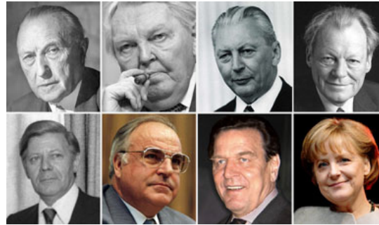
Pictures: Handwriting of Goethe – The German Chancellors since 1949 – The political system – Mercedes Benz 260 D (1936) – Dürer: The Praying hands.

(5) Busy, always on time and a little bit boring – Everyday Life in Germany – Discussion with guests from the Institute for German Cultural Studies